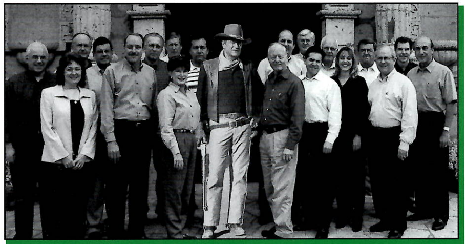
NHA board members, committee chairmen and staff members (and John Wayne!) set the tone for 2002 at NHA's Annual Board Retreat in October.

The NHA VISION is a Quarterly Publication for North Houston Association Members.