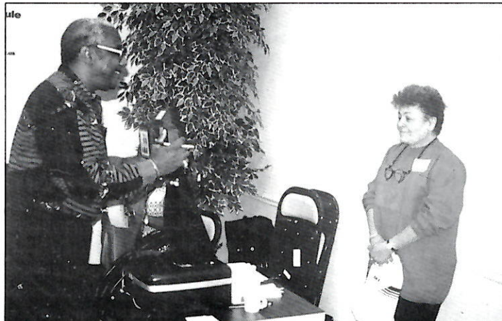
Seniors got their Metro identification cards made on-site at the transportation options luncheon.

Metro has extremely good services. It's just a matter of introducing people to Metro's services so they'll use them.