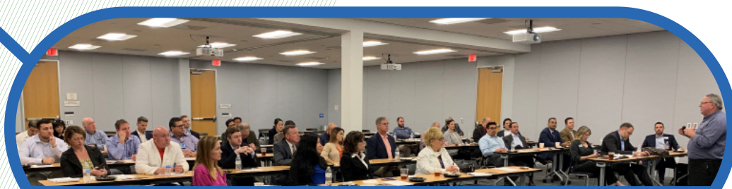
In 2019 NHA: Held 23 committee meetings with 518 attendees. Boasted over 930 attendees at events. Appeared 14 times in the media. Had 93 event & meeting sponsors