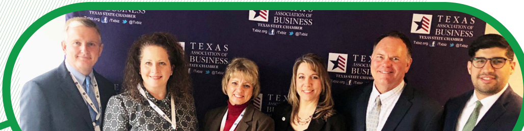
NHA made several advocacy trips to Austin during the legislative session testifying in support of HB478 & SB7

NHA twice provided public comments at Harris County Commissioners Court on the topic of transportation funding