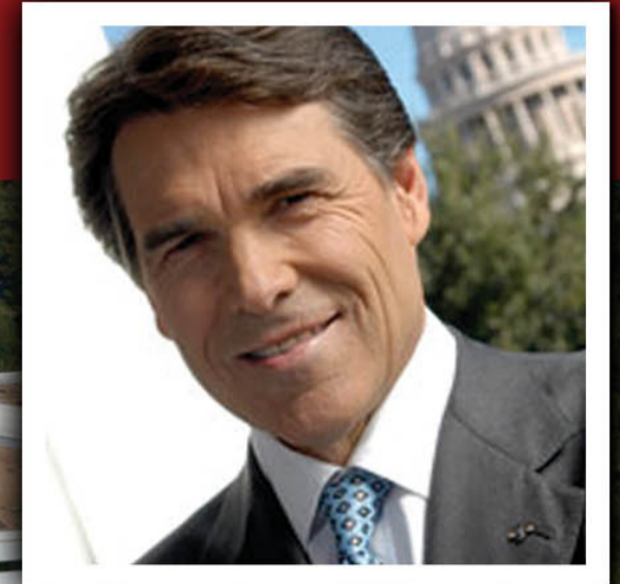
Rick Perry Governor of Texas